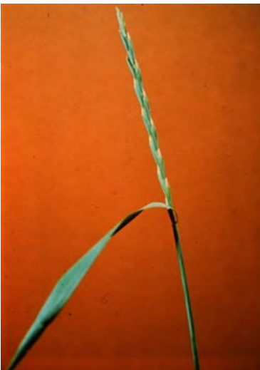
Quackgrass seeds on spike

ALWAYS READ AND FOLLOW ALL PESTICIDE LABEL DIRECTIONS. Obey all label precautions, safety measures, and wear all recommended personal protective equipment. Use of brand names does not connote endorsement and is for reference only; other products with the same active ingredients may be available under other names. Pesticide product registration is renewed annually and