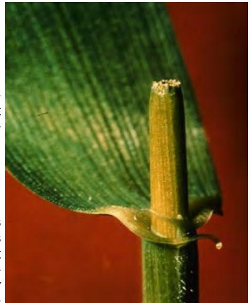
Close-up of quackgrass leaf attachment.

Effective quackgrass control can be accomplished using a systemic herbicide. Systemic herbicides circulate through the upper plant tissue, roots, and rhizomes killing the entire plant. Unfortunately there are no selective herbicide products that will kill quackgrass without injuring turf or most other grasses. Often repeat applications are required because even systemic herbicides can fail to kill dormant buds that can produce regrowth sometime later. Monitoring the area after any control is performed (an repeating control efforts) is essential to reduce population size and eventual elimination of quackgrass.