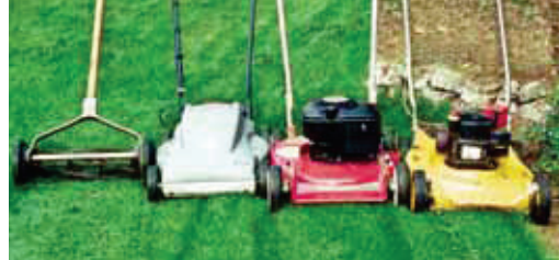
Electric and gas “mulching” mowers (center) chop clippings and blow them down to soil to decompose.

Keep blades sharp! Dull blades tear the grass, leaving ugly brown tips and inviting disease. Mower shops do a good job, or learn to sharpen blades yourself.